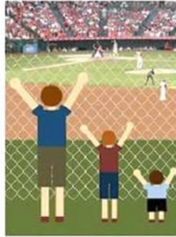
Changing the system