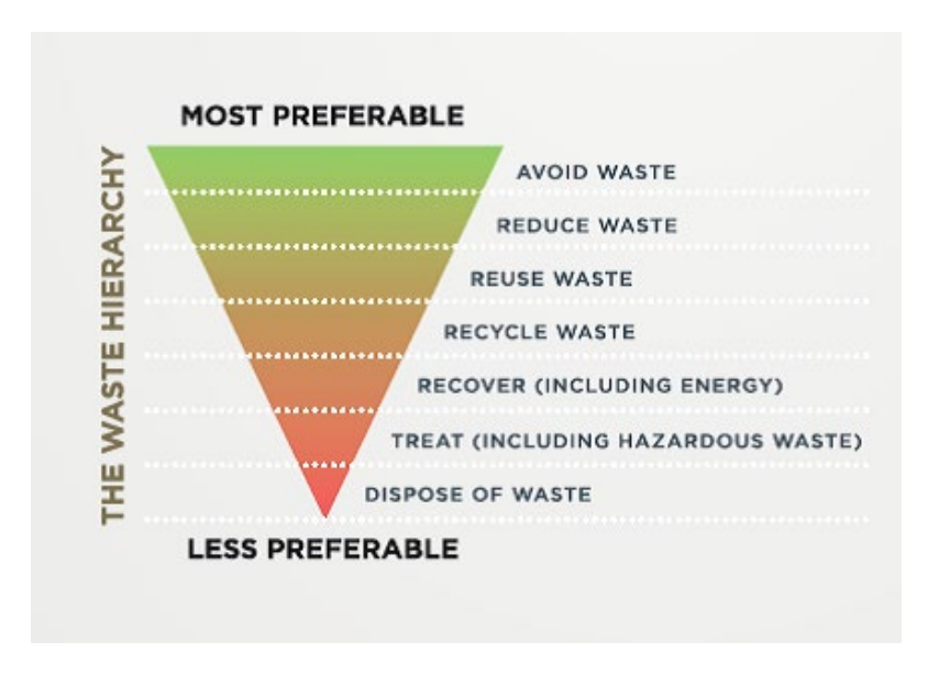
Figure 2. The 2018 National Waste Policy (Less waste, More Resources) Framework<sup>3</sup>