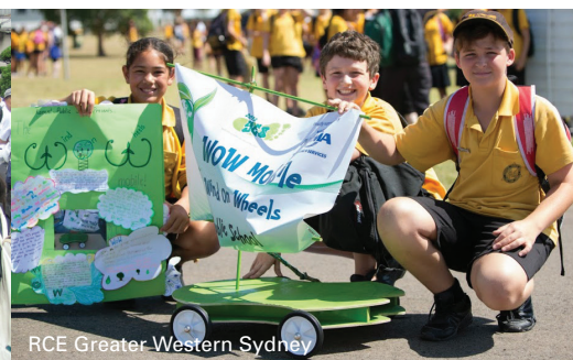
RCE Greater Western Sydney