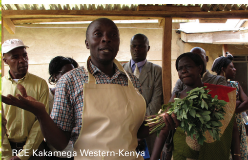
RCE Kakamega Western-Kenya