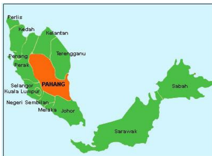
Figure 2. Pahang state and its location in Malaysia (PSDC)

Lynas Advanced Materials Plant (LAMP) is situated in Gebeng Industrial Estate, adjacent to the Balok River. The estate lies within the capital city Kuantan, in the Pahang state. Kuantan and its metropolitan area, which is located at the edge of the South China Sea, have a population of more than half a million. The Gebeng site is located just inland from a coastal mangrove forest, and several miles up a river that flows out to the sea past a fishing village. Gebeng bypass eases traffic flow from the industrial estate to Kuantan Port and has close proximity to Kuantan deep-water and all-weather port. It links Kuala Lumpur and Kuantan directly through the East Coast Highway. This route provides a cost effective and convenient means of transportation (see Figure 2-3).