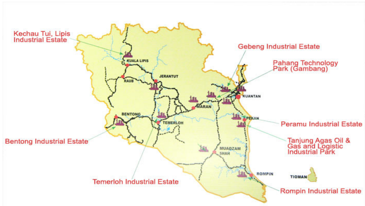
Figure 3. LAMP at Gebeng industrial estate (PSDC)

The estate, which drains into the nearby South China Sea, offers an industrial infrastructure where access to utility, chemical and petrochemical manufacturing business clusters is readily available. Major chemical corporations within the estate are Polyplastics Asia Pacific, BASF-PETRONAS, Petronas CUF, Petronas Centralises Emergency Facilities and PDH plant. It has easy access to sources of gas, water and electricity.